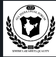
All India Legal Forum