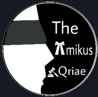
THE AMIKUS QRIAE