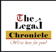
The Legal Chronicle