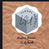
LIU LEGAL BLOG