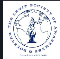
The Legit Society Of Awareness & Bolster