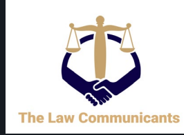
The Law Communicant