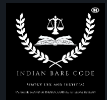
INDIAN BARE CODE